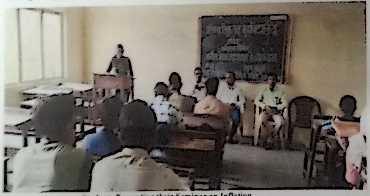
Students Presenting their Seminar on Inflation

The seminar saw active participation from students across various disciplines, contributing to a diverse and enriched discussion. Q&A sessions allowed for an interactive exchange of ideas, enabling a deeper understanding of the complexities surrounding inflation.