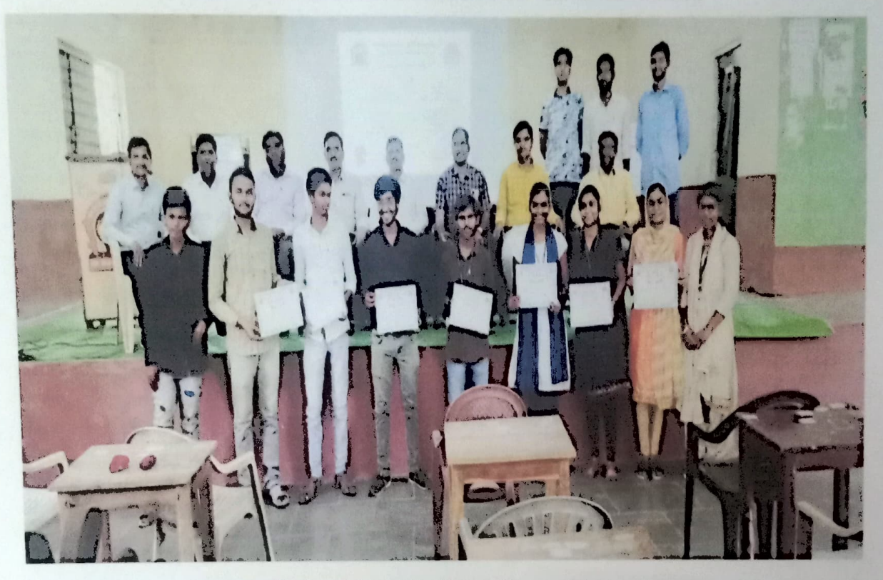
National Integrity Essay Competition